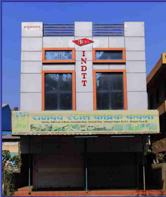
INDTT PUNE BRANCH INDRAYANI NAGAR, BHOSARI,