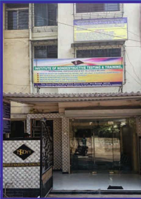
INDTT NAVI MUMBAI BRANCH, AIROLI, MUMBAI