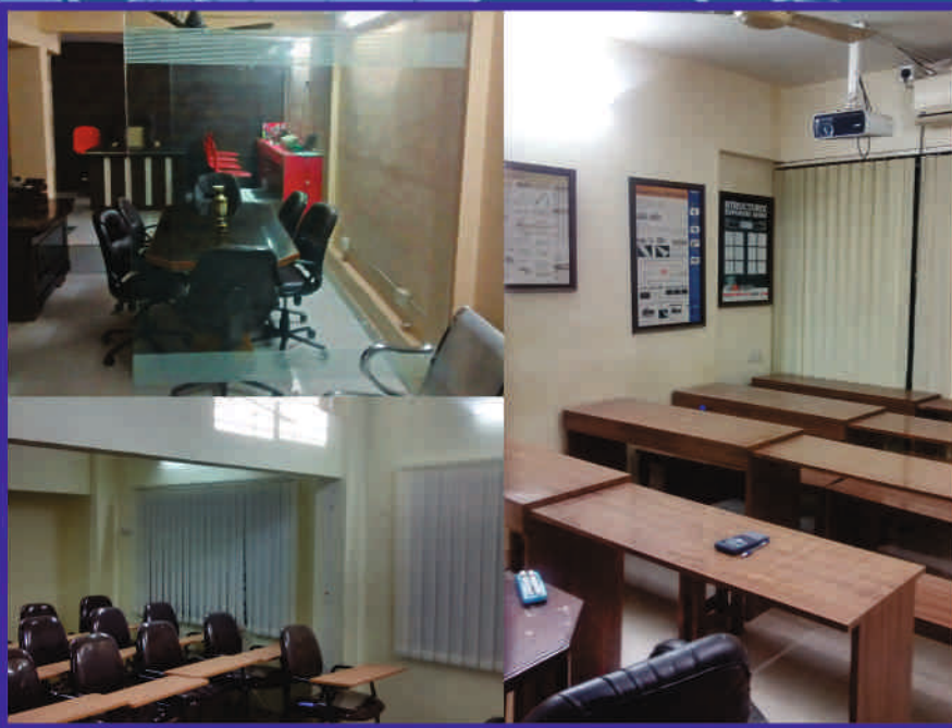
INDTT TRAINING CENTER